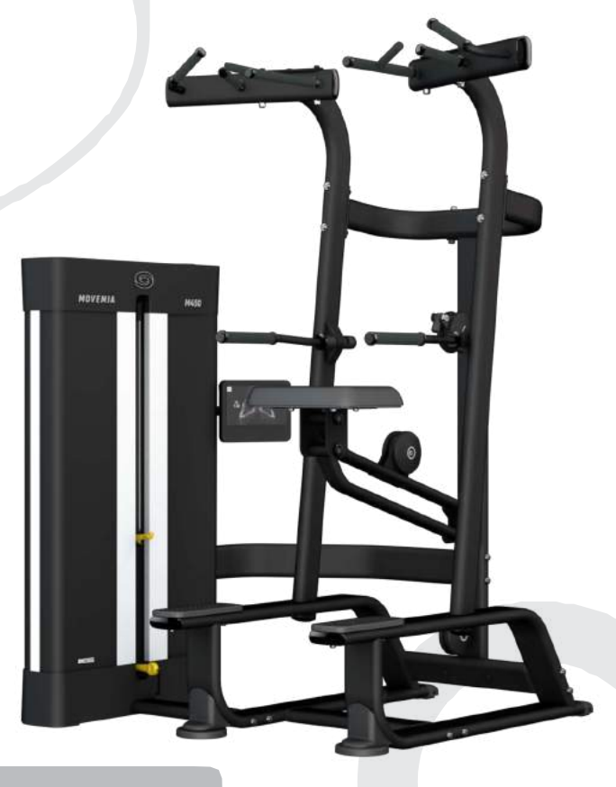
INTERMEDIATE LOADS. A very simple movement with a finger is enough in order to activate intermediate loads