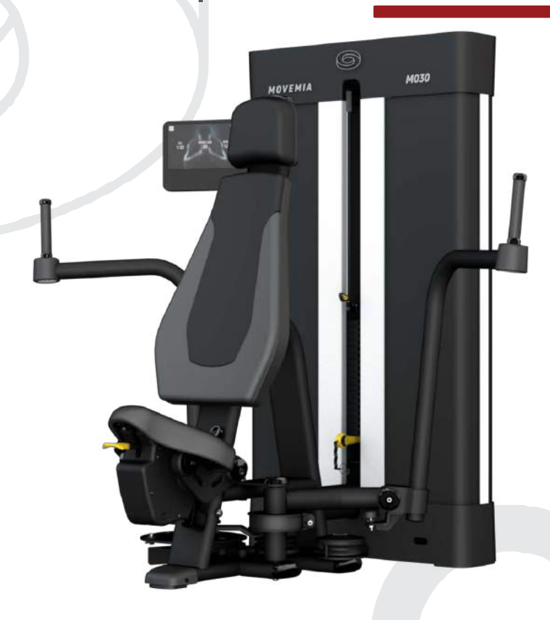
INTERMEDIATE LOADS. A very simple movement with a finger is enough in order to activate intermediate loads (+2,5Kg)