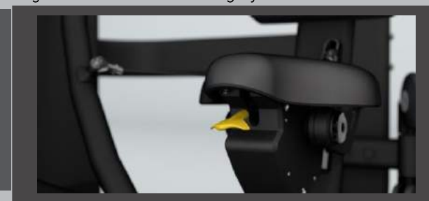
VERTICAL HANDLE. The grips are designed for adapating to any kind of user