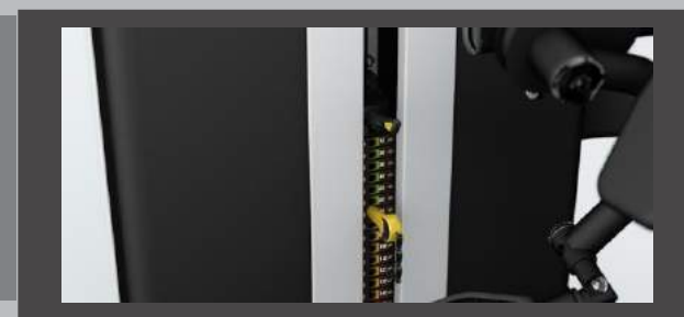
SIMPLE AND COMFORTABLE ADJUSTMENTS. Ergonomic levers and user-friendly adjustments