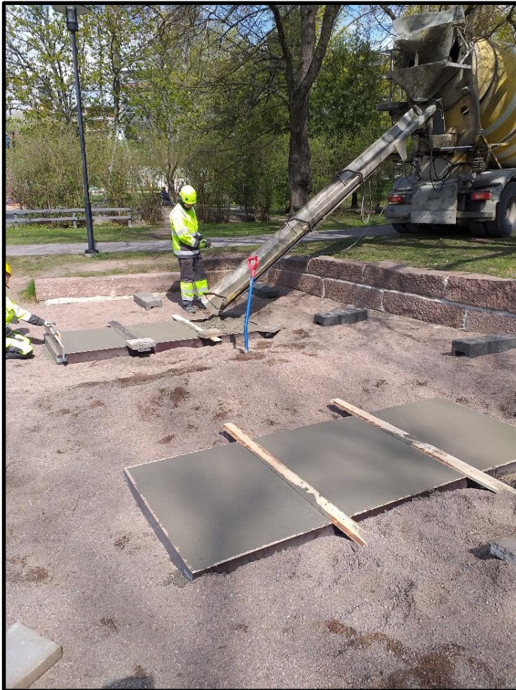
Adequate drying time