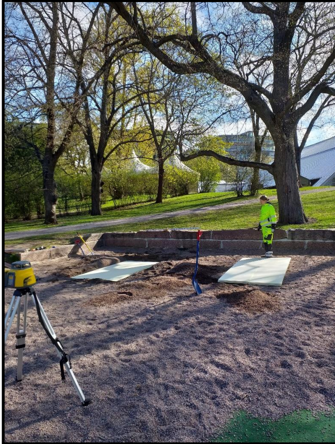
Ground frost insulation