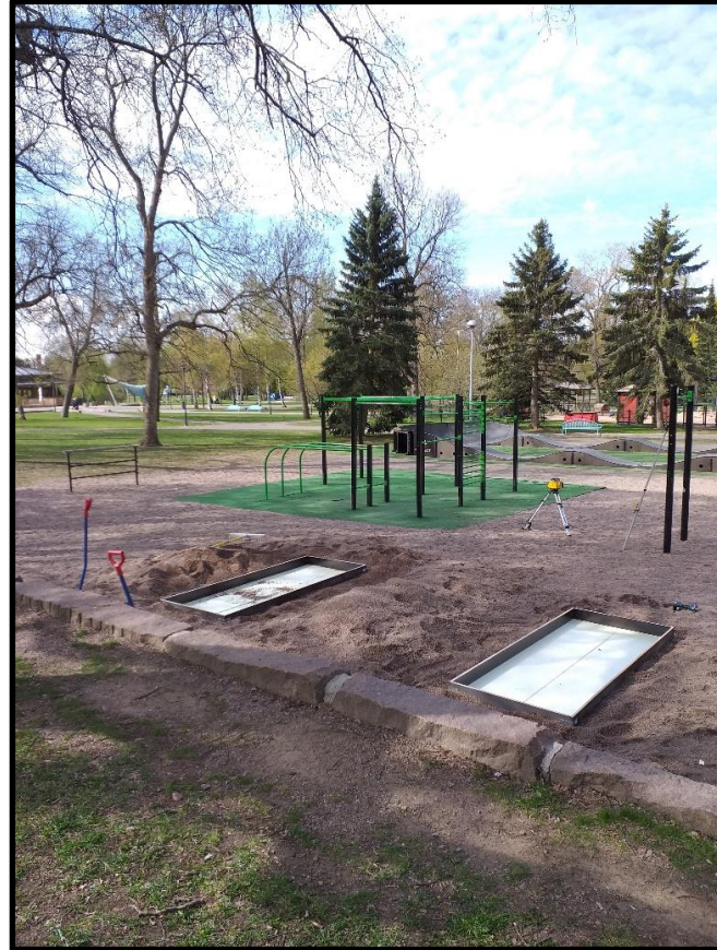
Ground frost insulation