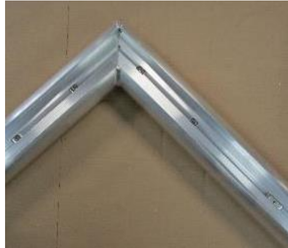
Elements for connection upright/ crossbar (2 x 2 nuts 20 mm, M8 + 1 nuts 40 mm, M6)