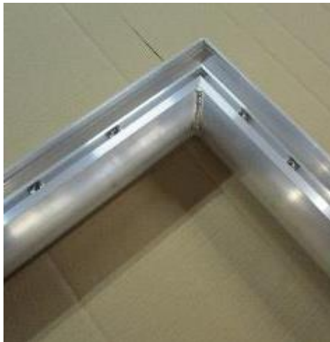
Elements for connection bar/ Ground tube (2 x 2 nuts 20 mm, M8)